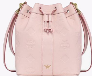
DESSAU DRAWSTRING BAG IN MAXI MONOGRAM LEATHER (MEDIUM) THB 46,700 / NOW THB 32,690