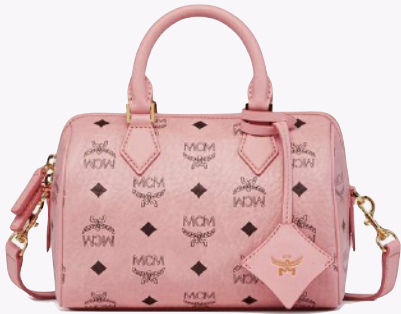
ELLA BOSTON BAG IN VISETOS (SMALL)