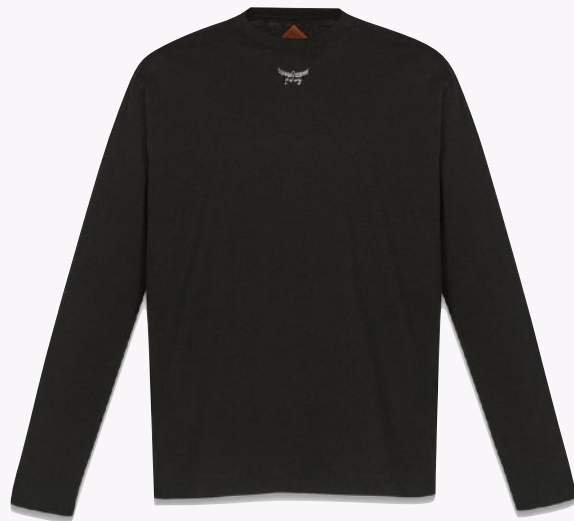
ESSENTIAL LAUREL LOGO SHIRT IN ORGANIC COTTON SIZE : M THB 11,000 / NOW THB 5,500