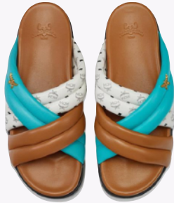
MONOGRAM CROSS SANDALS IN LAMB LEATHER SIZE : 41,42,43 THB 23,900 / NOW THB 9,560