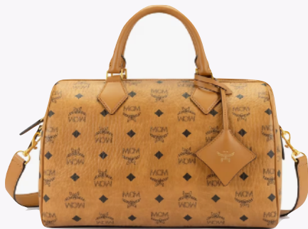
ELLA BOSTON BAG IN VISETOS (MEDIUM) THB 37,100 / NOW THB 25,970