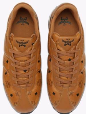
DIAMANTE SNEAKERS IN QUILTED MONOGRAM LEATHER

SIZE 36,37,38,39,40 THB 17,500 / NOW THB 10,500