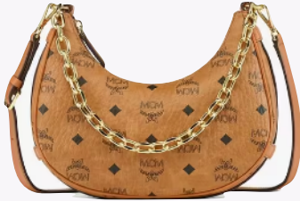
AREN CRESCENT HOBO BAG IN VISETOS