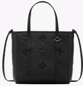
TONI TOP-ZIP SHOPPER IN MAXI MONOGRAM LEATHER (MINI) THB 33,000 / NOW THB 23,100