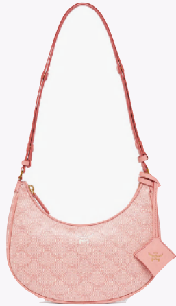
HIMMEL ASCENDING MOON HOBO IN LAURETOS