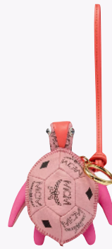
AREN TURTLE CHARM IN VISETOS