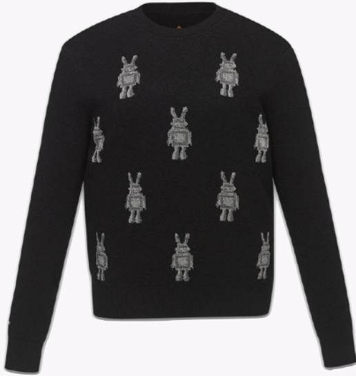
RABOT SWEATER IN WOOL JACQUARD SIZE : S,M THB 25,800 / NOW THB 12,900