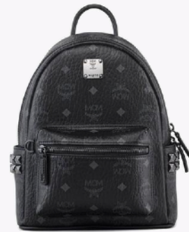
STARK SIDE STUDS BACKPACK IN VISETOS (MINI) THB 42,300 / NOW THB 29,610