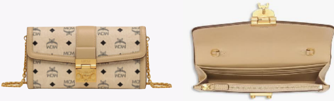
TRIFOLD CHAIN WALLET IN VISETOS (LARGE) THB 23,600 / NOW THB 11,800