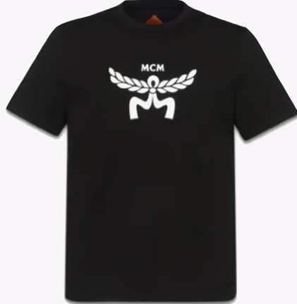
LAUREL LOGO PRINT T-SHIRT IN ORGANIC COTTON SIZE : S,M,L,XL THB 11,000 / NOW THB 5,500