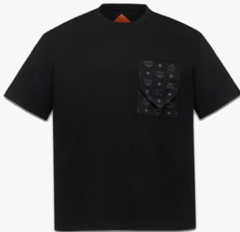
MONOGRAM PATCH POCKET T-SHIRT IN ORGANIC COTTON SIZE : S,M THB 9,900 / NOW THB 4,950