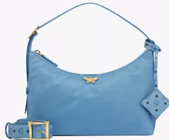
AREN HOBO IN RECYCLED NYLON AND MONOGRAM PRINT LEATHER THB 27,300 / NOW THB 10,920