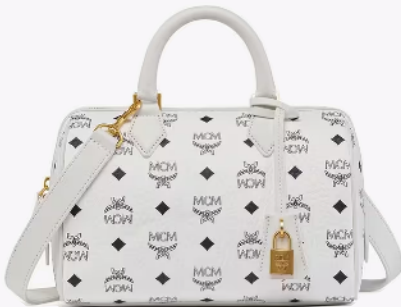
ELLA BOSTON BAG IN VISETOS (SMALL)