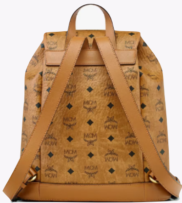
AREN DRAWSTRING BACKPACK IN VISETOS THB 42,300 / NOW THB 29,610