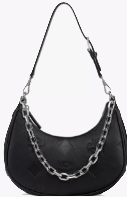
AREN CRESCENT HOBO BAG IN MAXI MONOGRAM LEATHER (SMALL) THB 42,300 / NOW THB 29,610