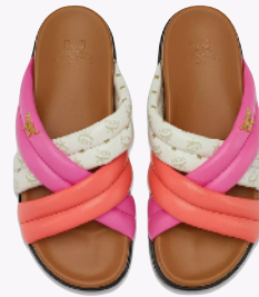
MONOGRAM CROSS SANDALS IN LAMB LEATHER SIZE : 37,39 THB 23,900 / NOW THB 9,560