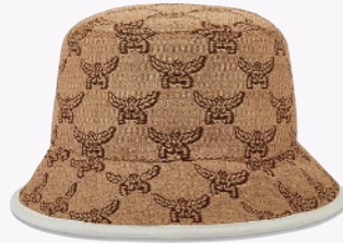
BUCKET HAT IN LAURETOS RAFFIA JACQUARD THB 13,500 / NOW THB 5,400