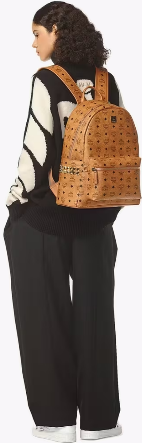
STARK BACKPACK IN VISETOS (MEDIUM) THB 51,500 / NOW THB 25,750