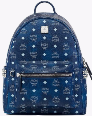
STARK SIDE STUDS BACKPACK IN VISETOS (SMALL-MEDIUM) THB 47,800 / NOW THB 23,900