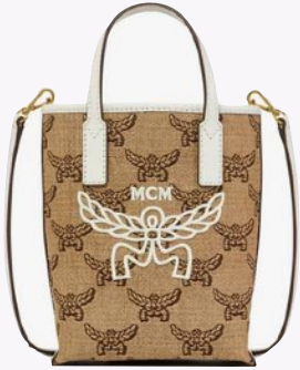
HIMMEL CROSSBODY IN LAURETOS RAFFIA JACQUARD (MINI) THB 23,500 / NOW THB 9,400