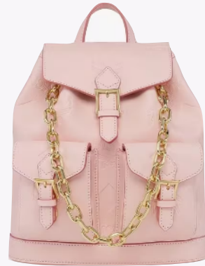
AREN DRAWSTRING BACKPACK IN MAXI MONOGRAM LEATHER (SMALL) THB 49,600 / NOW THB 34,720