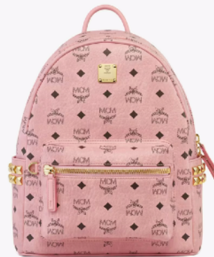
STARK SIDE STUDS BACKPACK IN VISETOS (SMALL) THB 44,100 / NOW THB 22,050