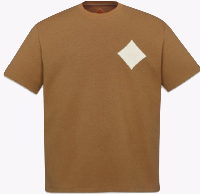
LOGO PATCH BOUCLÉ T-SHIRT SIZE : L,XL THB 13,500 / NOW THB 6,750