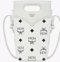
DIAMOND CROSSBODY POUCH IN VISETOS LEATHER MIX THB 18,000 / NOW THB 7,200