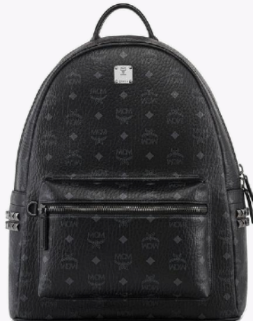
STARK SIDE STUDS BACKPACK IN VISETOS (MEDIUM) THB 51,500 / NOW THB 36,050