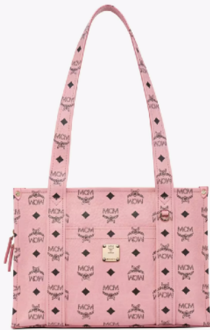
AREN SCHOOL BAG TOTE IN VISETOS (SMALL) THB 29,500 / NOW THB 14,750