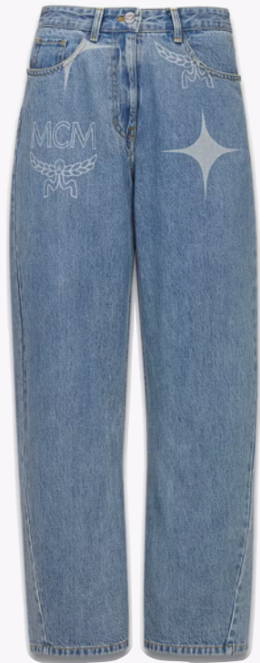
CONSTELLATION DENIM JEANS SIZE : 38,40 THB 20,400 / NOW THB 10,200