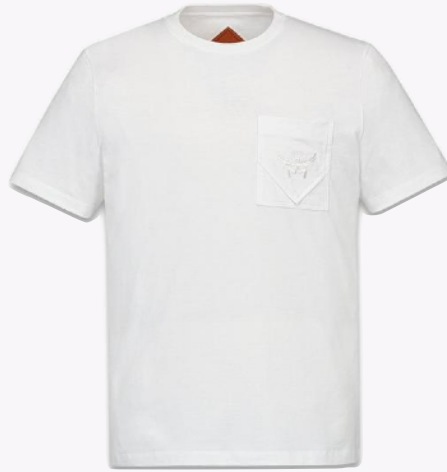
LARGE ESSENTIAL LOGO POCKET T-SHIRT IN ORGANIC COTTON WHITE SIZE : S,M,L THB 8,300 / NOW THB 4,150