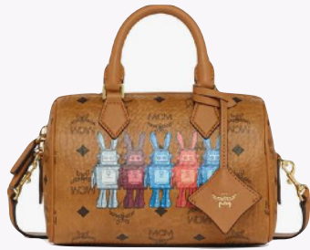
AREN LANYARD ID WALLET IN ROBOT VISETOS (SMALL) THB 38,900 / NOW THB 27,230