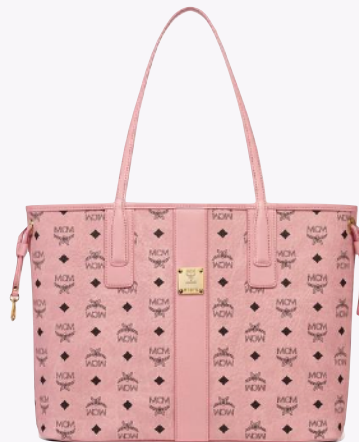
REVERSIBLE LIZ SHOPPER IN VISETOS (MEDIUM) THB 30,300 / NOW THB 15,150