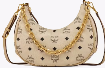
AREN CRESCENT HOBO BAG IN VISETOS