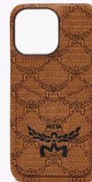
IPHONE 15PRO CASE IN LAURETOS THB 6,800 / NOW THB 2,720