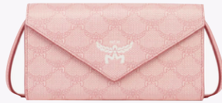
HIMMEL CROSSBODY WALLET IN LAURETOS THB 21,500 / NOW THB 8,600