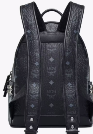
STARK SIDE STUDS BACKPACK IN VISETOS (SMALL) THB 42,800 / NOW THB 29,960