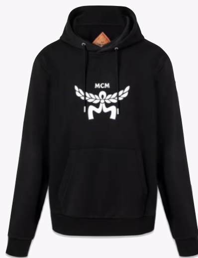
CLASSIC LOGO HOODIE IN ORGANIC COTTON SIZE : M,L,XL THB 19,000 / NOW THB 9,500