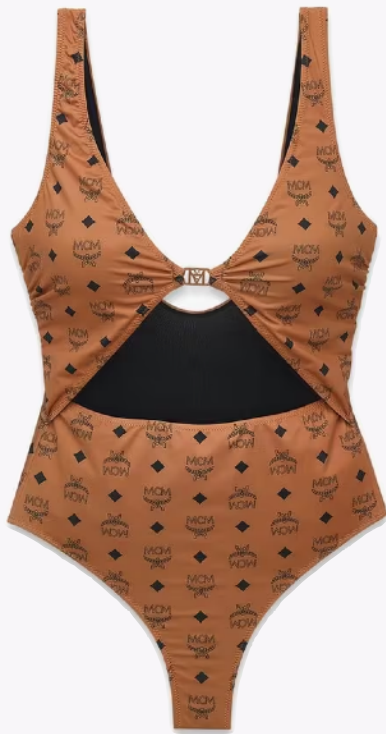
MONOGRAM PRINT SWIMSUIT SIZE : S,M