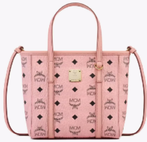
TONI TOP-ZIP SHOPPER IN VISETOS (MINI) THB 26,200 / NOW THB 13,100