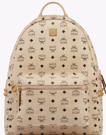
STARK SIDE STUDS BACKPACK IN VISETOS (MEDIUM) THB 51,500 / NOW THB 36,050