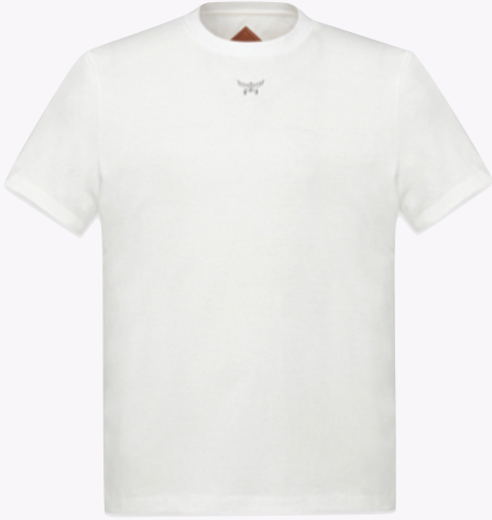
ESSENTIAL LOGO PRINT T-SHIRT IN ORGANIC COTTON SIZE : S,XL THB 8,300 / NOW THB 4,150