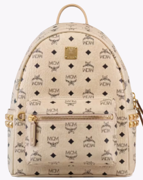
STARK SIDE STUDS BACKPACK IN VISETOS (SMALL) THB 44,100 / NOW THB 30,870