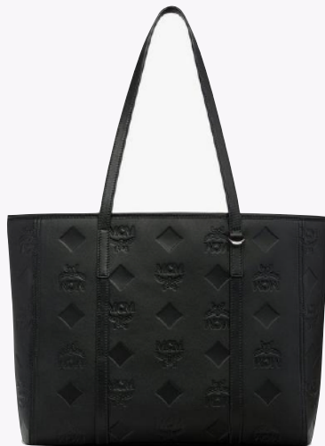
TONI TOP-ZIP SHOPPER IN MAXI MONOGRAM LEATHER (MEDIUM) THB 36,800 / NOW THB 25,760