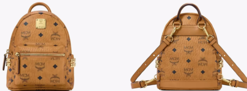
STARK BEBE BOO SIDE STUDS BACKPACK IN VISETOS (X-MINI)