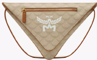
HIMMEL TRIANGLE POUCH IN LAURETOS THB 19,200 / NOW THB 7,680