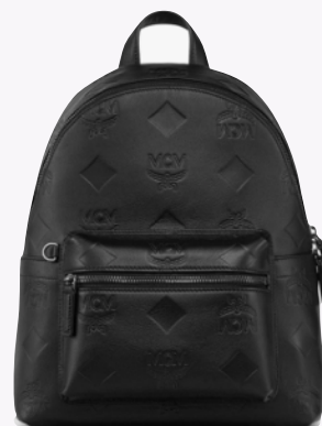
STARK BACKPACK IN MAXI MONOGRAM LEATHER (SMALL) THB 53,300 / NOW THB 37,310