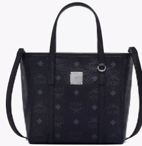
TONI TOP-ZIP SHOPPER IN VISETOS (MINI) THB 26,200 / NOW THB 18,340