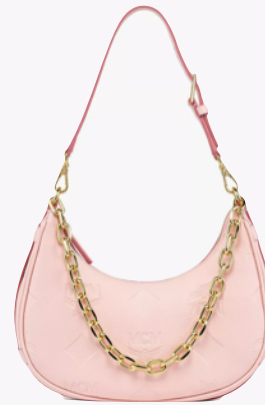
AREN CRESCENT HOBO BAG IN MAXI MONOGRAM LEATHER (SMALL) THB 42,300 / NOW THB 29,610