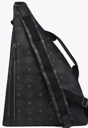
AREN SLING IN VISETOS (MEDIUM) THB 33,800 / NOW THB 23,660