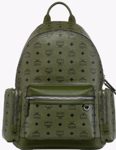
STARK BACKPACK IN VISETOS (MEDIUM) THB 51,500 / NOW THB 25,750