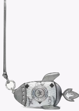
AREN ROCKET POUCH CHARM IN VISETOS THB 12,300 / NOW THB 7,380