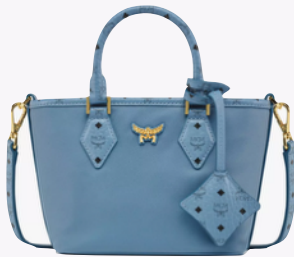
AREN SHOPPER IN RECYCLED NYLON AND MONOGRAM PRINT LEATHER THB 22,300 / NOW THB 8,920