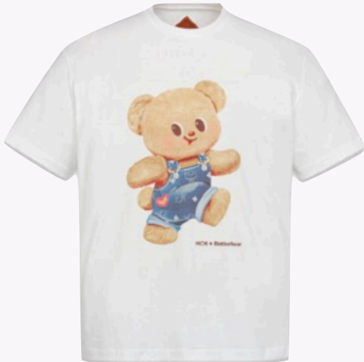
MCM X BUTTERBEAR T-SHIRT SIZE : XS,S THB 11,200 / NOW THB 4,480