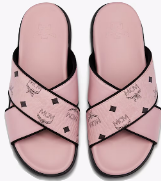
CROSS SANDAL IN VISETOS LEATHER MIX

SIZE 36,37,38,39,40 THB 7,900 / NOW THB 4,740