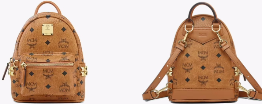
STARK BEBE BOO SIDE STUDS BACKPACK IN VISETOS (X-MINI)