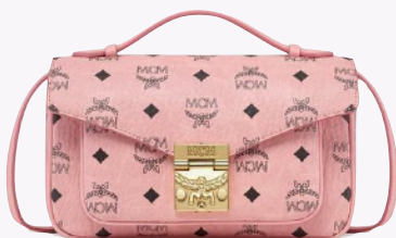
TRACY CROSSBODY IN VISETOS (MEDIUM) THB 35,100 / NOW THB 17,550