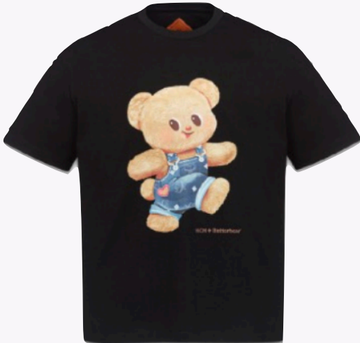
MCM X BUTTERBEAR T-SHIRT SIZE : XS,S THB 11,200 / NOW THB 4,480