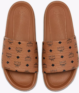
MONOGRAM PRINT RUBBER SLIDES

SIZE 36,37,38,39,40,41,42,43,44,45 THB 9,000 / NOW THB 5,400