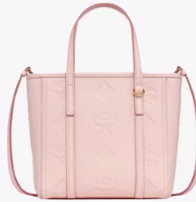
TONI TOP-ZIP SHOPPER IN MAXI MONOGRAM LEATHER (MINI) THB 33,000 / NOW THB 23,100