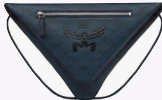
HIMMEL TRIANGLE POUCH IN LAURETOS THB 19,200 / NOW THB 7,680