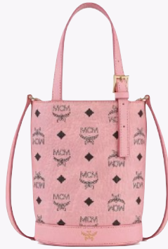
AREN BUCKET TOTE IN VISETOS (MINI) THB 26,200 / NOW THB 13,100