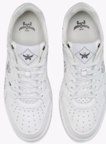
NEO TERRAIN SNEAKERS IN VISETOS SIZE : 37,38,39,41,42 THB 18,500 / NOW THB 7,400