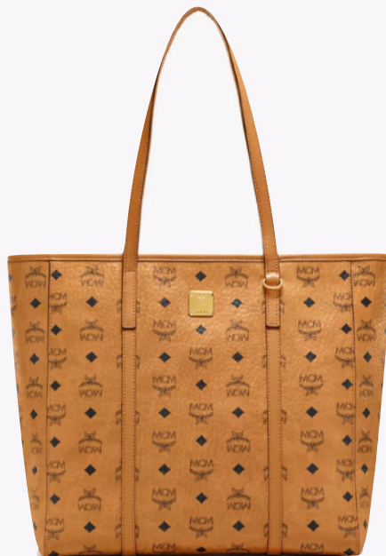
TONI TOP-ZIP SHOPPER IN VISETOS (MEDIUM) THB 29,200 / NOW THB 20,440