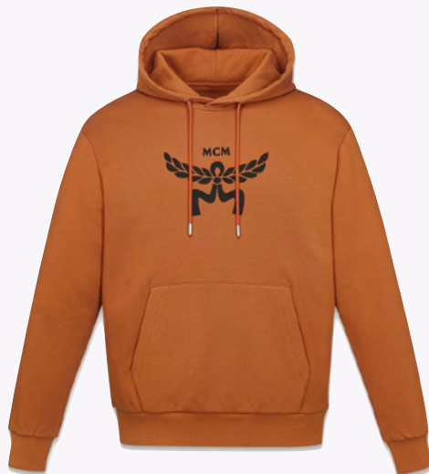
CLASSIC LOGO HOODIE IN ORGANIC COTTON SIZE : M,L,XL THB 19,000 / NOW THB 9,500