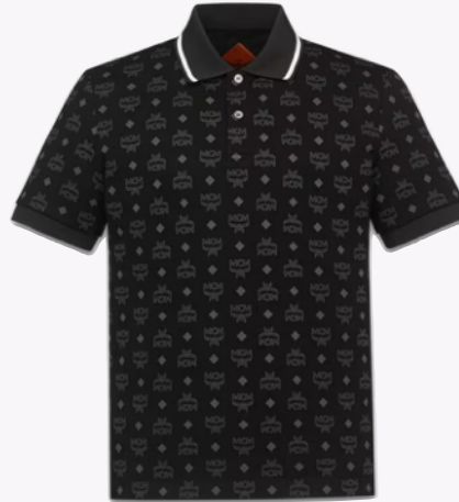
MONOGRAM JACQUARD POLO SHIRT SIZE : S,M,L THB 18,500 / NOW THB 9,250