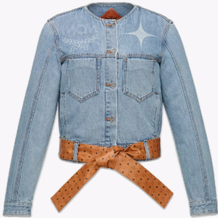
CONSTELLATION DENIM JACKET WITH MONOGRAM LEATHER BELT SIZE : 40,42,44 THB 35,000 / NOW THB 17,500