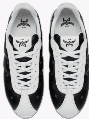
DIAMANTE SNEAKERS IN QUILTED MONOGRAM LEATHER

SIZE 41,42,43 THB 17,200 / NOW THB 10,320