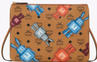
AREN CROSSBODY POUCH (SMALL) THB 22,800 / NOW THB 15,960