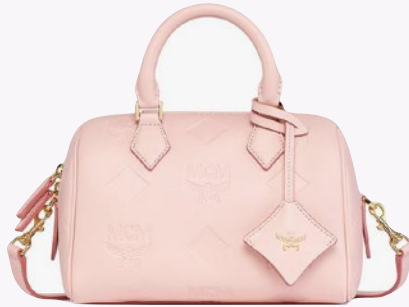
ELLA BOSTON BAG IN MAXI MONOGRAM LEATHER (SMALL) THB 44,400 / NOW THB 31,080