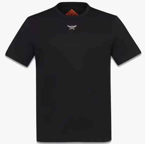
ESSENTIAL LOGO PRINT T-SHIRT IN ORGANIC COTTON SIZE : S,M,L THB 8,300 / NOW THB 4,150