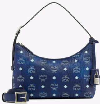
AREN HOBO IN VISETOS (MEDIUM)