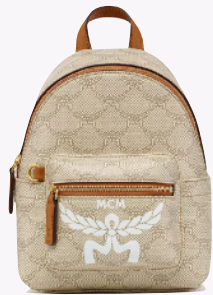
STARK BEBE BOO BACKPACK IN LAURETOS (X-MINI)