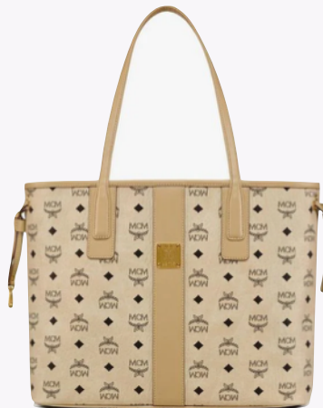
REVERSIBLE LIZ SHOPPER IN VISETOS (MEDIUM)