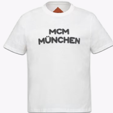
MÜNCHEN T-SHIRT IN ORGANIC COTTON SIZE : S,M,L THB 12,300 / NOW THB 6,150