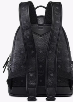
STARK SIDE STUDS BACKPACK IN VISETOS (SMALL) THB 44,100 / NOW THB 30,870