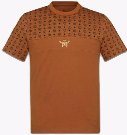
MONOGRAM PRINT T-SHIRT IN ORGANIC COTTON SIZE : S,M,L,XL THB 12,300 / NOW THB 6,150