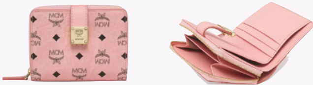
AREN BRASS PLATE WALLET IN VISETOS THB 13,800 / NOW THB 6,900