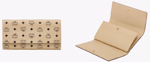
TRIFOLD WALLET IN VISETOS (LARGE) THB 17,500 / NOW THB 8,750