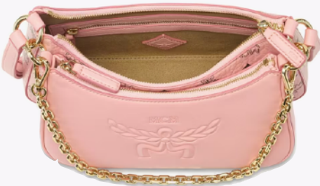
AREN DUO HOBO IN VISETOS THB 35,200 / NOW THB 17,600