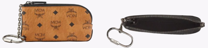
KEY POUCH IN VISETOS THB 9,200 / NOW THB 4,600