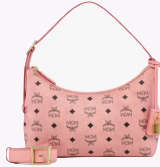
AREN HOBO IN VISETOS (MEDIUM)