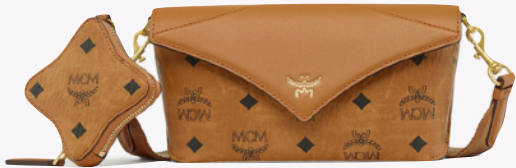
DIAMOND CROSSBODY WITH AIRPODS PRO CHARM IN VISETOS THB 26,100 / NOW THB 10,440