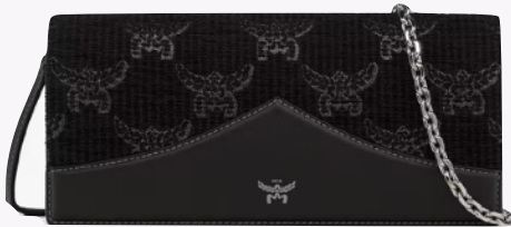
DIAMOND CLUTCH IN LAURETOS LUREX JACQUARD (SMALL) THB 31,300 / NOW THB 21,910