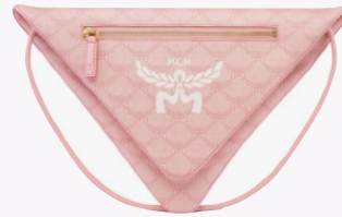
HIMMEL TRIANGLE POUCH IN LAURETOS THB 19,200 / NOW THB 7,680