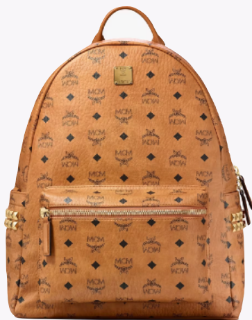
STARK SIDE STUDS BACKPACK IN VISETOS (MEDIUM) THB 49,800 / NOW THB 34,860