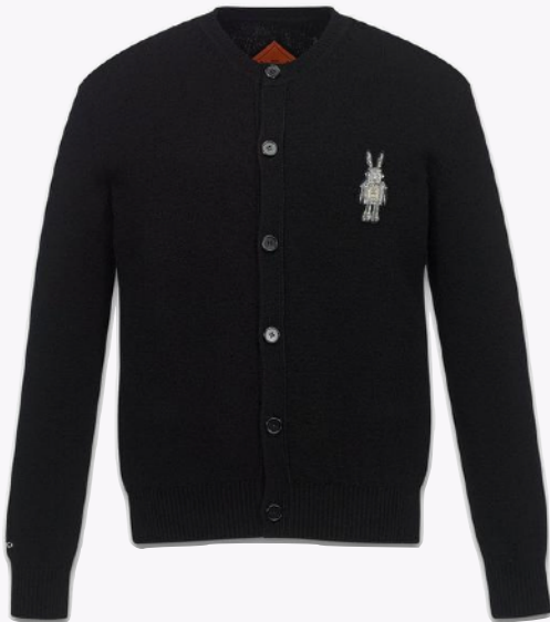
RABOT PATCH WOOL KNIT CARDIGAN SIZE : M,L THB 24,700 / NOW THB 12,350