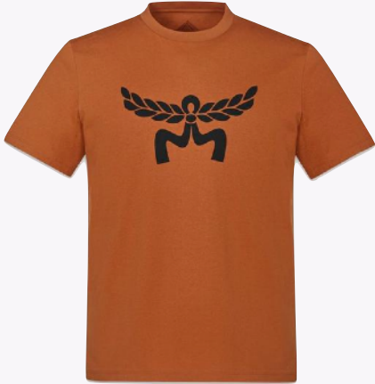
LAUREL LOGO PRINT T-SHIRT IN ORGANIC COTTON SIZE : S,M,L,XL THB 11,000 / NOW THB 5,500