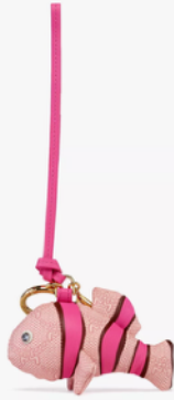
HIMMEL 3D CLOWNFISH CHARM IN LAURETOS