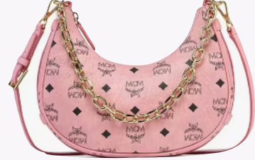
AREN CRESCENT HOBO BAG IN VISETOS