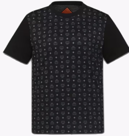
MONOGRAM PRINT T-SHIRT IN ORGANIC COTTON SIZE : M,L THB 12,300 / NOW THB 6,150