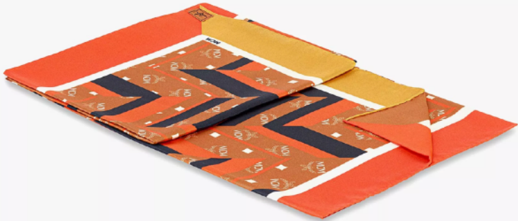
MEGA HERRINGBONE PRINT SCARF IN ORGANIC SILK THB 15,500 / NOW THB 7,750