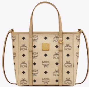
TONI TOP-ZIP SHOPPER IN VISETOS (MINI) THB 26,200 / NOW THB 18,340