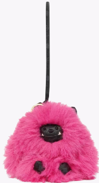
AREN MARSDOG CHARM IN FAUX FUR VISETOS THB 11,200 / NOW THB 6,720