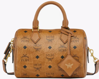
ELLA BOSTON BAG IN VISETOS (SMALL) THB 35,300 / NOW THB 24,710