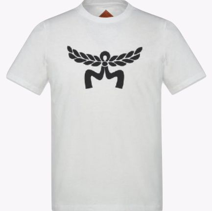
LAUREL LOGO PRINT T-SHIRT IN ORGANIC COTTON SIZE : M,L THB 11,000 / NOW THB 5,500