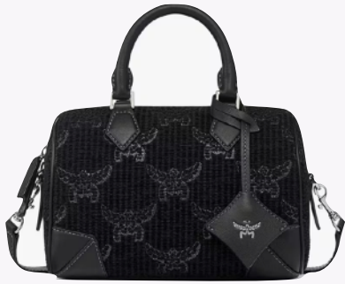
ELLA BOSTON BAG IN LAURETOS LUREX JACQUARD (SMALL) THB 35,300 / NOW THB 24,710