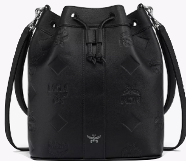
DESSAU DRAWSTRING BAG IN MAXI MONOGRAM LEATHER (MEDIUM) THB 46,700 / NOW THB 32,690