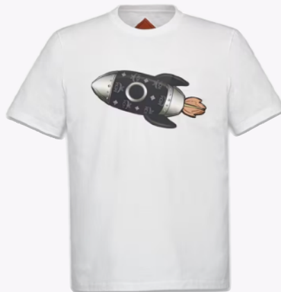
ROCKET T-SHIRT IN ORGANIC COTTON SIZE : S,M,L,XL THB 11,200 / NOW THB 5,600