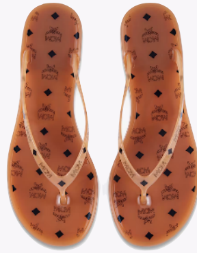
MONOGRAM JELLY THONG SANDALS

SIZE 36,37,38,39,40,41,42,43,44,45 THB 9,000 / NOW THB 5,400