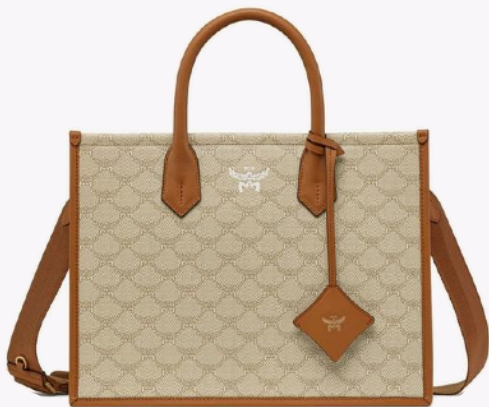
HIMMEL TOTE IN LAURETOS (MEDIUM)