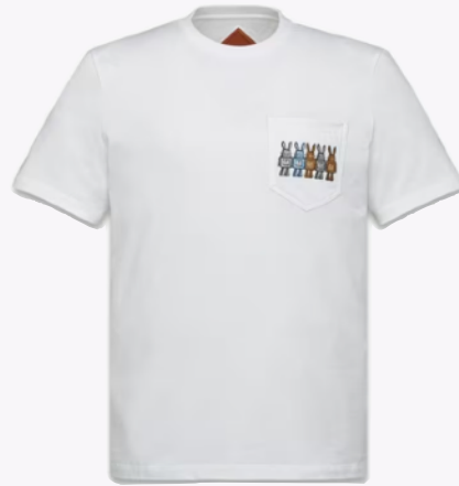
RABOT POCKET T-SHIRT IN ORGANIC COTTON SIZE : S,M,XL THB 11,200 / NOW THB 5,600