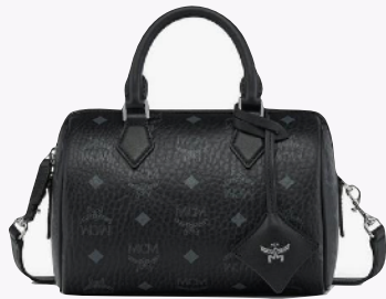
ELLA BOSTON BAG IN VISETOS (SMALL) THB 35,300 / NOW THB 24,710