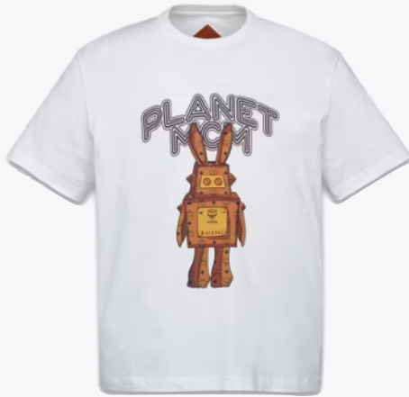
PLANET MCM RABOT T-SHIRT IN ORGANIC COTTON SIZE : S,M THB 12,300 / NOW THB 6,150