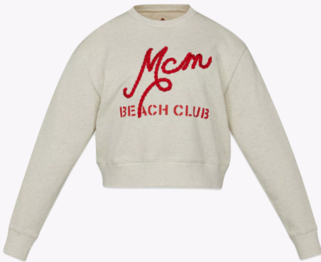
BEACH CLUB LOGO SWEATSHIRT SIZE : S,M,L