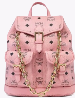
AREN DRAWSTRING BACKPACK IN VISETOS (MINI) THB 36,800 / NOW THB 19,300