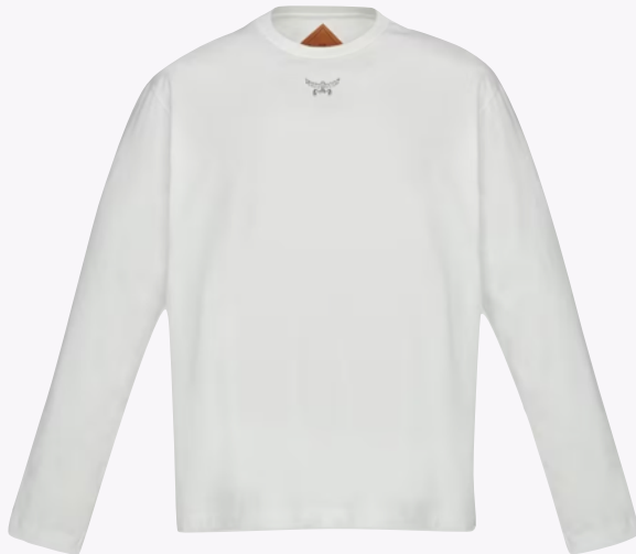
ESSENTIAL LAUREL LOGO SHIRT IN ORGANIC COTTON SIZE : M,L THB 11,000 / NOW THB 5,500